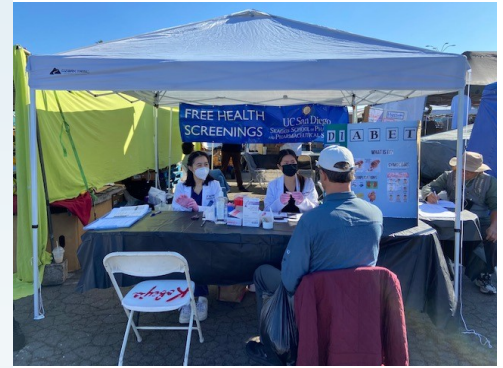
SSPPS students providing diabetes and hypertension screenings at the Kobey Swap Meet